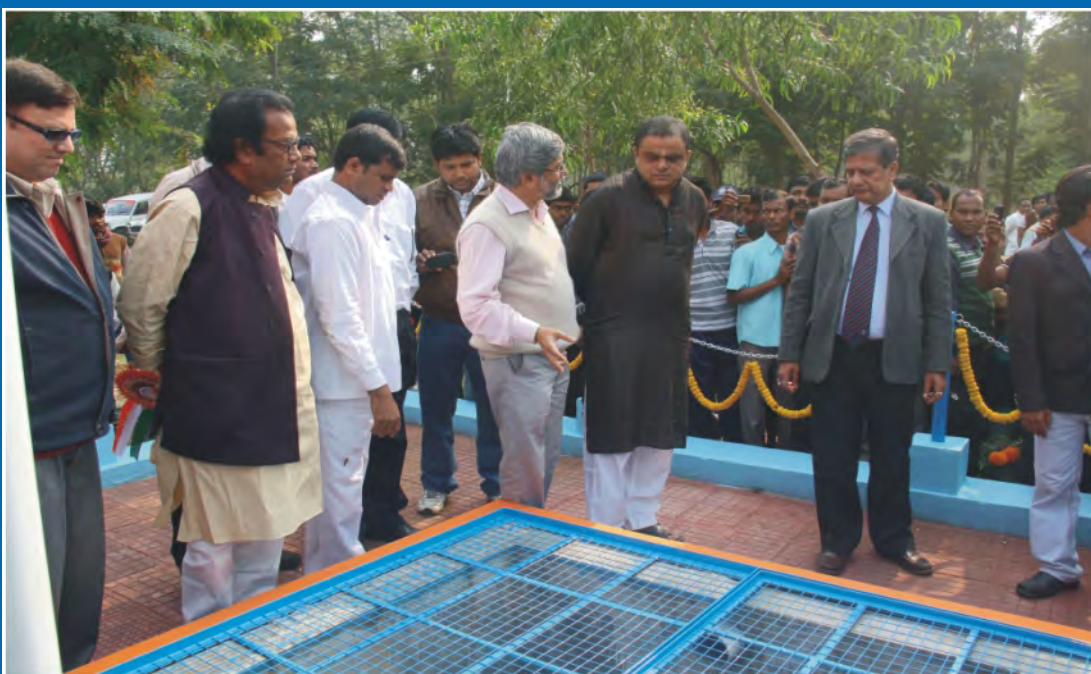
Shri Bratya Basu, Hon'ble Minister-in-charge, Higher Education, Govt. of West Bengal, inaugurated the Floortop Rainwater Harvesting Project in V.U.

Published by the Registrar Vidyasagar University Midnapore - 721102